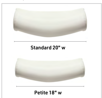
Petite seat option